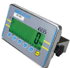
AE 402 Indicator